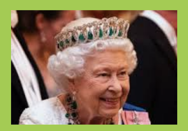
Rest in Peace ... Lady of Valor ...